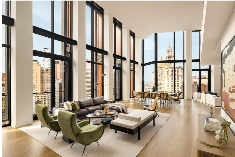
33 PARK ROW, UNIT PH3